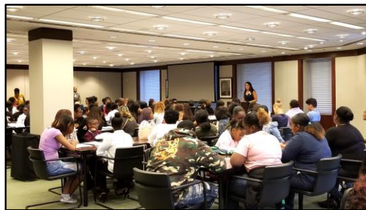
Incoming 9th graders and families begin their SLJ journey at Meet Your Advisor Night at Cravath.