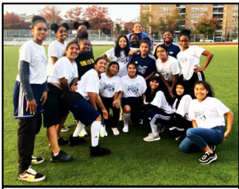
Young Women's Soccer.