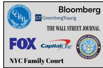
2019 Career Site Visit Day Hosts.