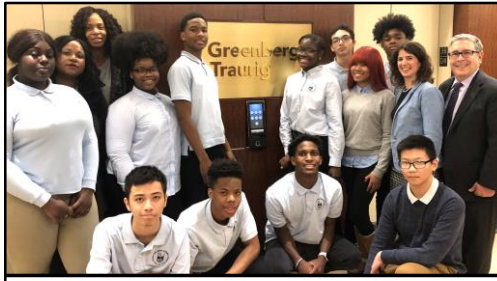
Career trip to Greenberg Traurig.