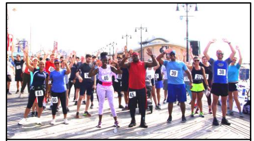
2019 Race Judicata.