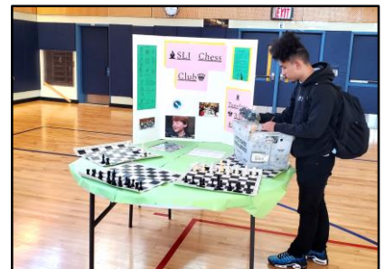
After School Club Recruitment Fair (Chess Club).