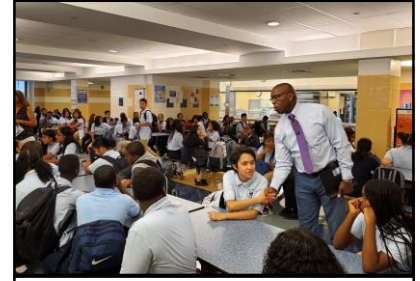
First Day of School.