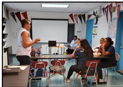
Smith College Representative Visit.