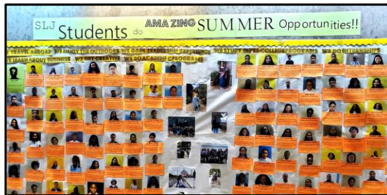
Summer Activities (study abroad, college courses, internships, etc.).